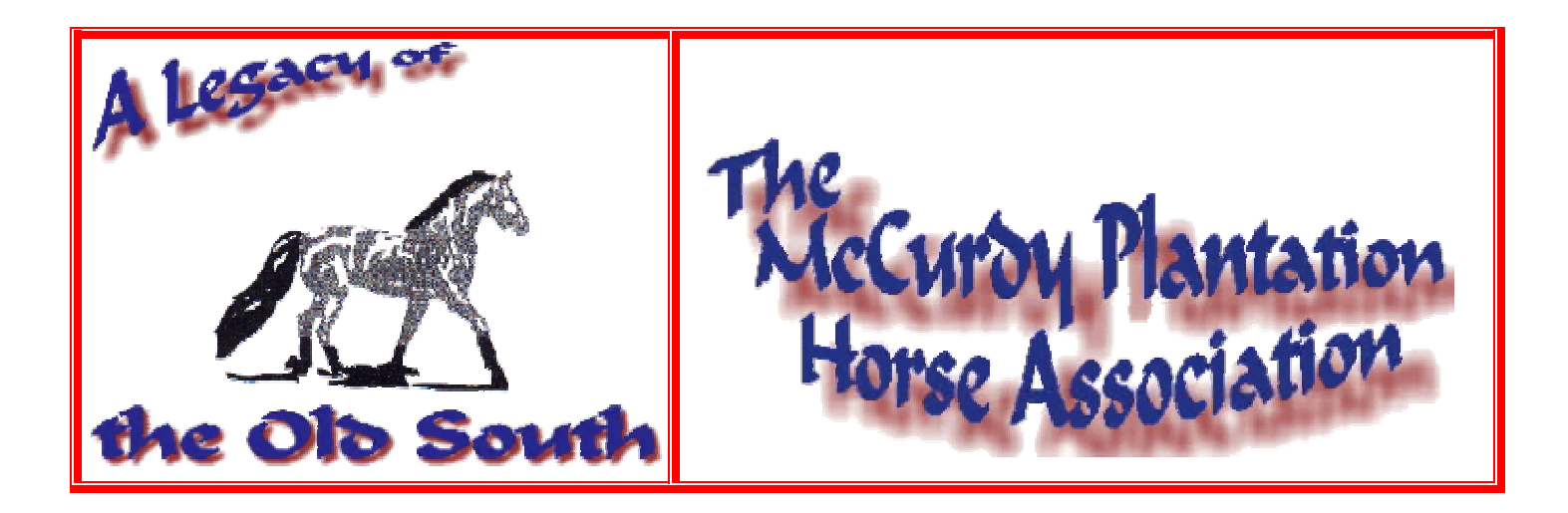
Board of Directors Meeting 2002